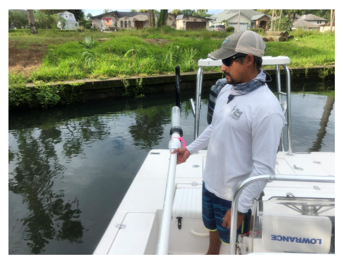
Figure 1. Core sampling device ready to be deployed in Canal 3, August 13, 2018.

Core samples from the benthos were collected using a customized vacuum core sampler developed by Florida Gulf Coast University for limnological studies and characterizing sediment types. The core sampler consists of a 3.1 meter-long section of 3.8 cm diameter schedule 40 PVC pipe, with a one-way ball valve, rubber coupler, and 7.6 diameter x 0.75 meter clear Plexiglas<sup>™</sup> cylinder at the base for collecting and viewing benthic samples (Figure 2).